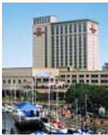
Portsmouth Renaissance Hotel